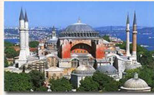
Hagia Sophia Istanbul